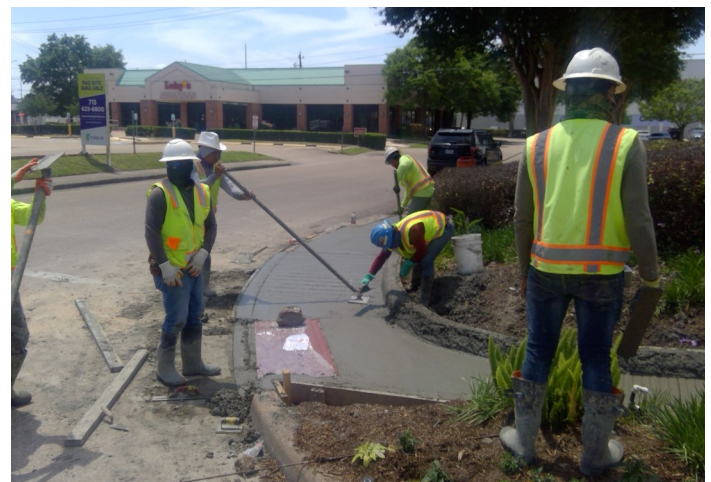
Finishing Ped Ramp and Installing Truncated Domes Mat.