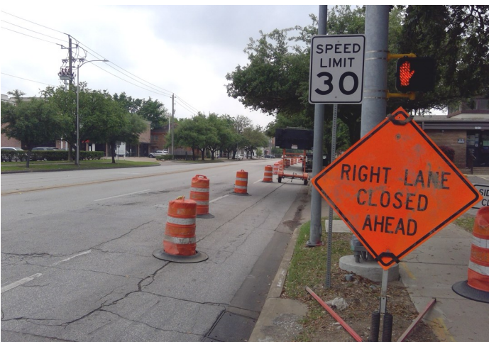
Traffic Control — Single Lane Closure