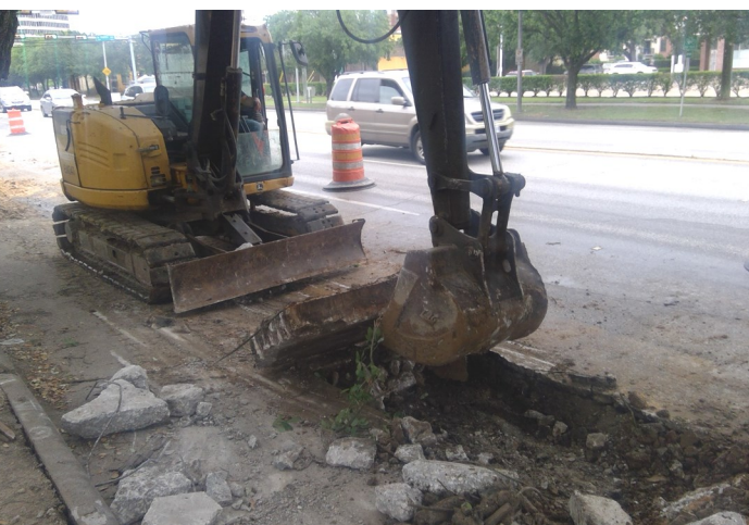
Removing Existing Pavement near Dallas Street.