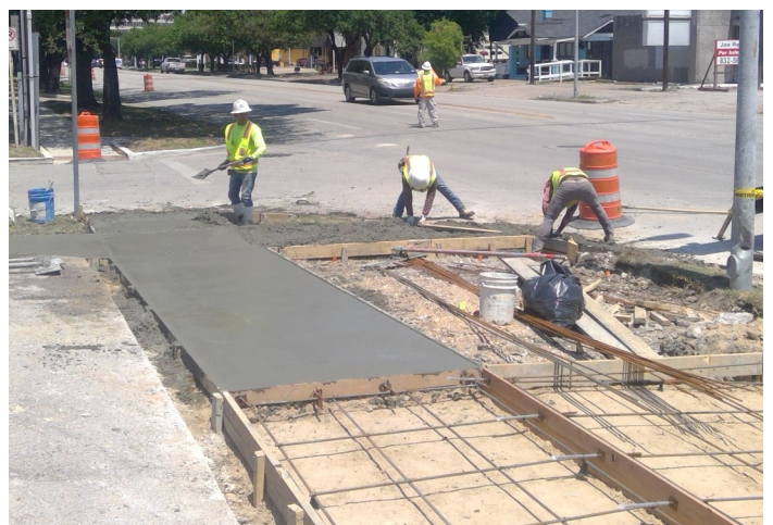
Finishing Ped Ramp Concrete Pour at West Clay and Waugh