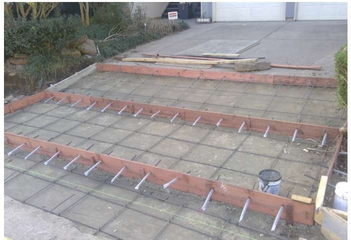
Forming work for Sidewalk and Driveway