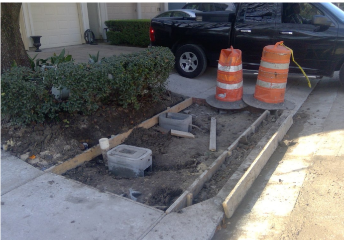
Remove & Replace Water Meter Box