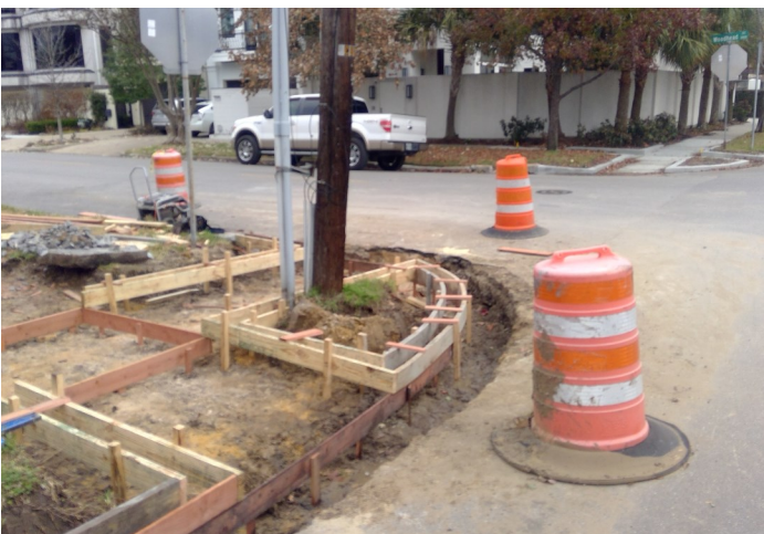
Forming work for Curb Ramp