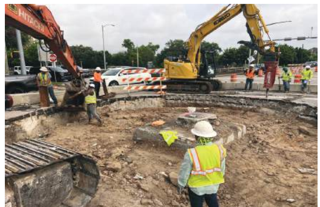
Excavation for Junction Box Installation