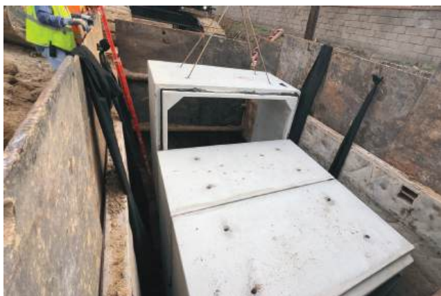
10'x10' RCB Installation