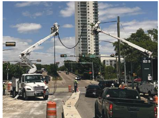
Temporary Signal at Allen Parkway