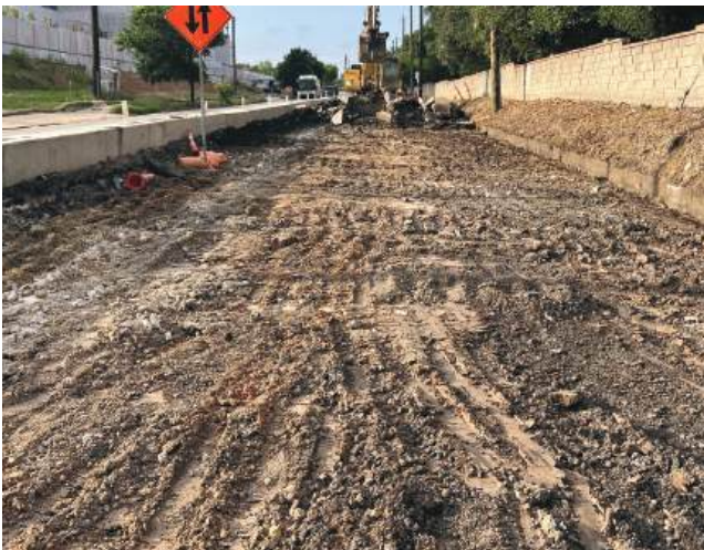
Pavement Demolition on West Side