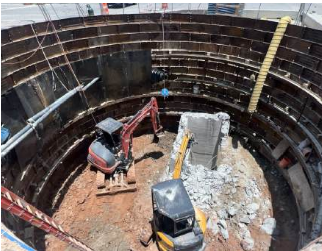
Liner Plate Shaft Installation