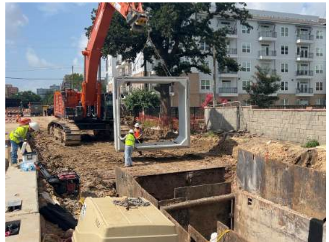
10'x10' RCB Installation