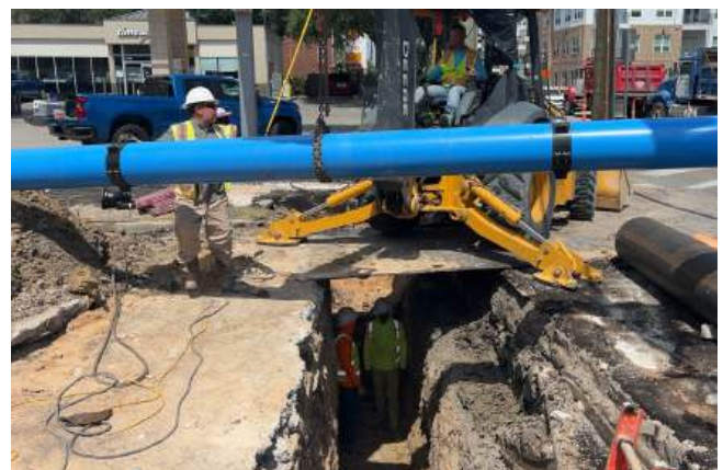
Water Line Installation