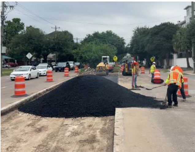
Temporary Asphalt Installation