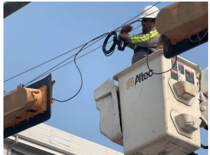
Temporary Signal at W Dallas Street