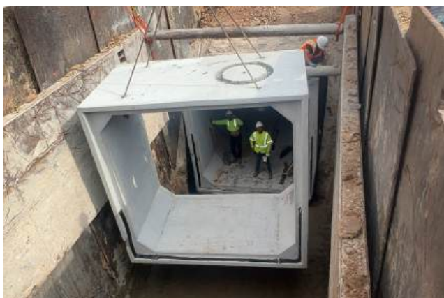
10'x10' RCB Installation