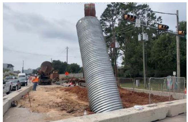
Temporary Manhole Installation